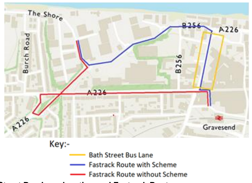
Figure 2: Bath Street Bus Lane location and Fastrack Routes

3.5 The scheme will improve journey times for Fastrack users and also facilitate additional bus stops to service existing residents and those from new developments such as Clifton Slipways, The Charter and Northfleet Embankment. These significant improvements to journey time and route would enhance Fastrack's reputation as a premium service.